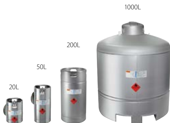
J.T.Baker® brand CYCLE-TAINER™ solvent delivery system sizes

J.T.Baker® CYCLE-TAINER™ solvent delivery system is an proprietary packaging option for high-volume users of solvents and reagents. The CYCLE-TAINER™ is a 100% reusable stainless steel vessel with built-in safety features. It comes pre-filled with J.T.Baker® high-purity solvents and reagents, and the positive-pressure, closed-dispensing system allows for quality in the laboratory and consistency during the scale-up process.